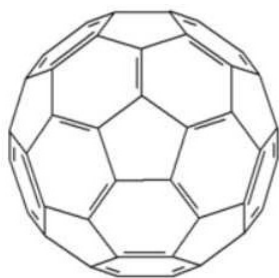
Fig. 2. A projection depiction of the buckminsterfullerene C_{60} .

The D -eigenvalues of the graph are as follows: \mu_1 = 7.46 , \mu_2 = -0.51 , \mu_3 = -1.08 , \mu_4 = -2 and \mu_5 = -3.86 . We obtain DEE(G) = 1738.2 .