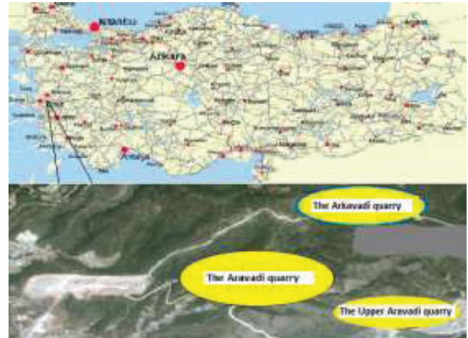
Fig. 1. Location of blast site quarries

Twenty-three blast tests were carried out: 8 in the Arkavadi limestone quarry, 6 in the Aravadi limestone quarry, and 9 in the Upper Aravadi limestone quarry. Figure 1 gives the locations of the quarries.